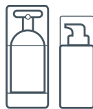
30 ml dispenser 50 ml dispenser